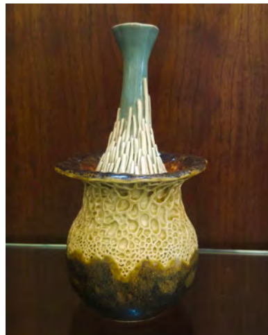
Ellen Griffin pottery